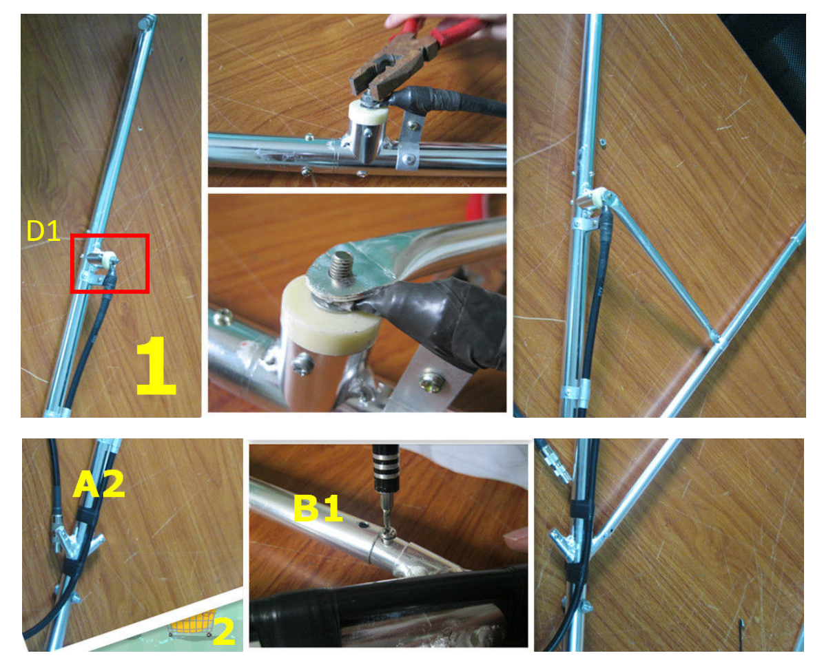
Step2: Connect another end of B1 to A2